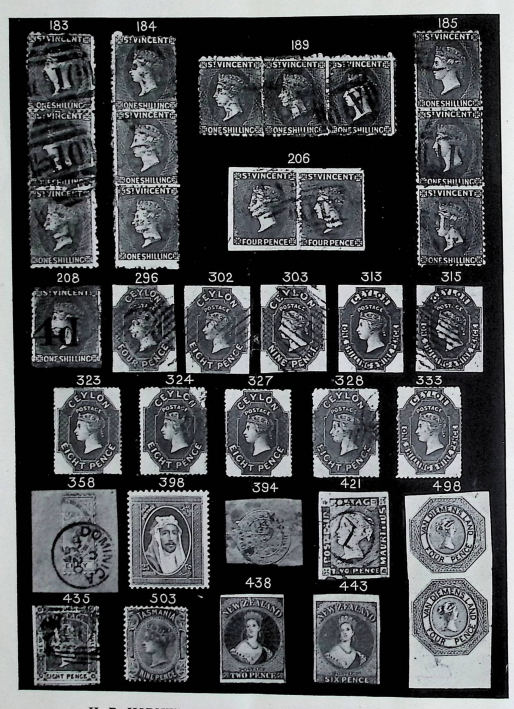
H. R. HARMER, 131-137, New Bond Street, London, W.1.