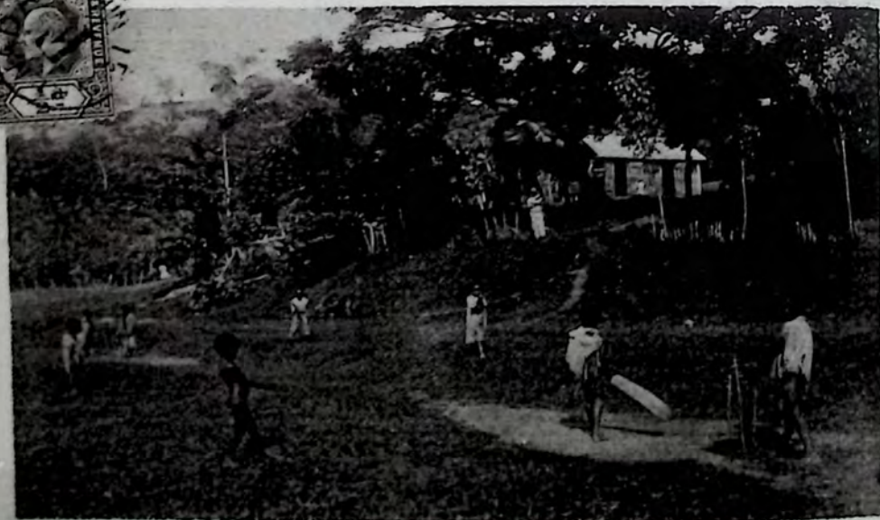
A Grenada Cricket Team